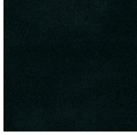
Crystal White - 03